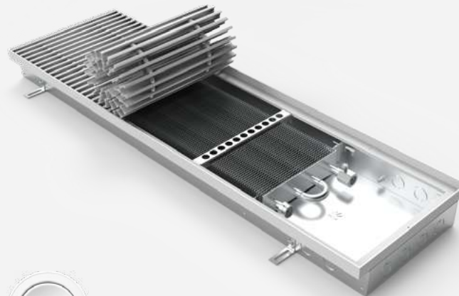
Корпус из нержавеющей стали